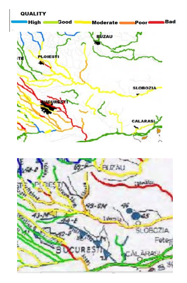
Figure 4.Biological status of the basin (left) and physicochemical (right) in 2009

In Figure 4 are outlined river lengths framed into a class depending on the biological and physico-chemical status.