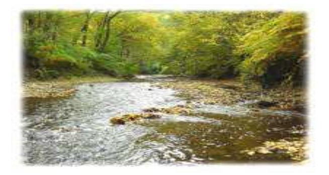
Figure3. View from Buzau River

River Basin Management Plan is the main instrument for implementing the Water Framework Directive, presents aspects of water quality management based on knowledge status of water bodies, set target goals over a period of six years (2009-2015) and propose measures to achieve "good status "of waters for their sustainable use. (Water Framework Directive)